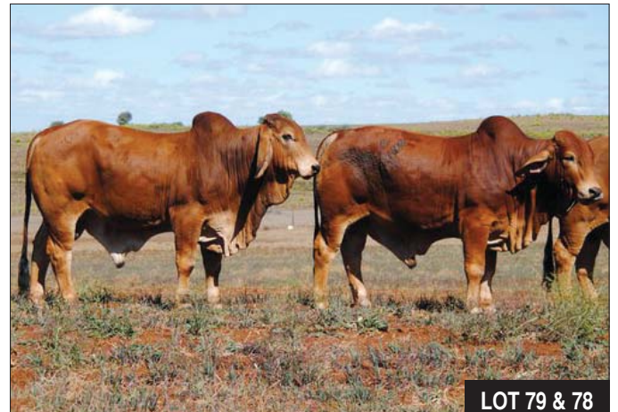
LOT 79 & 78