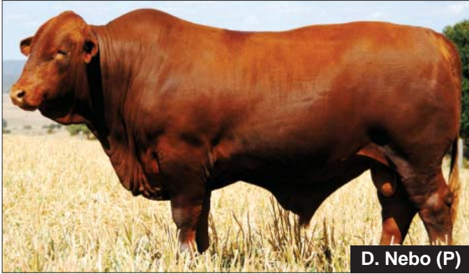
D. Nebo (P)