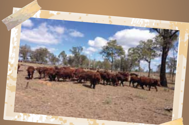
J. No 4 bulls at weaning time end May/early June 2014 - not much to eat!