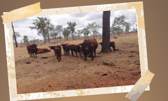
J. No 4 calves at "Jingeri" in early 2014 - Very dry