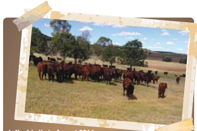
J. No 4 bulls in August 2014 after being shifted to "Kia-Ora", still no rain