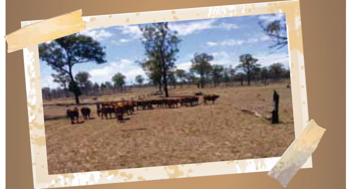
October 2014 - shifting some cows and calves @ "Jingeri"