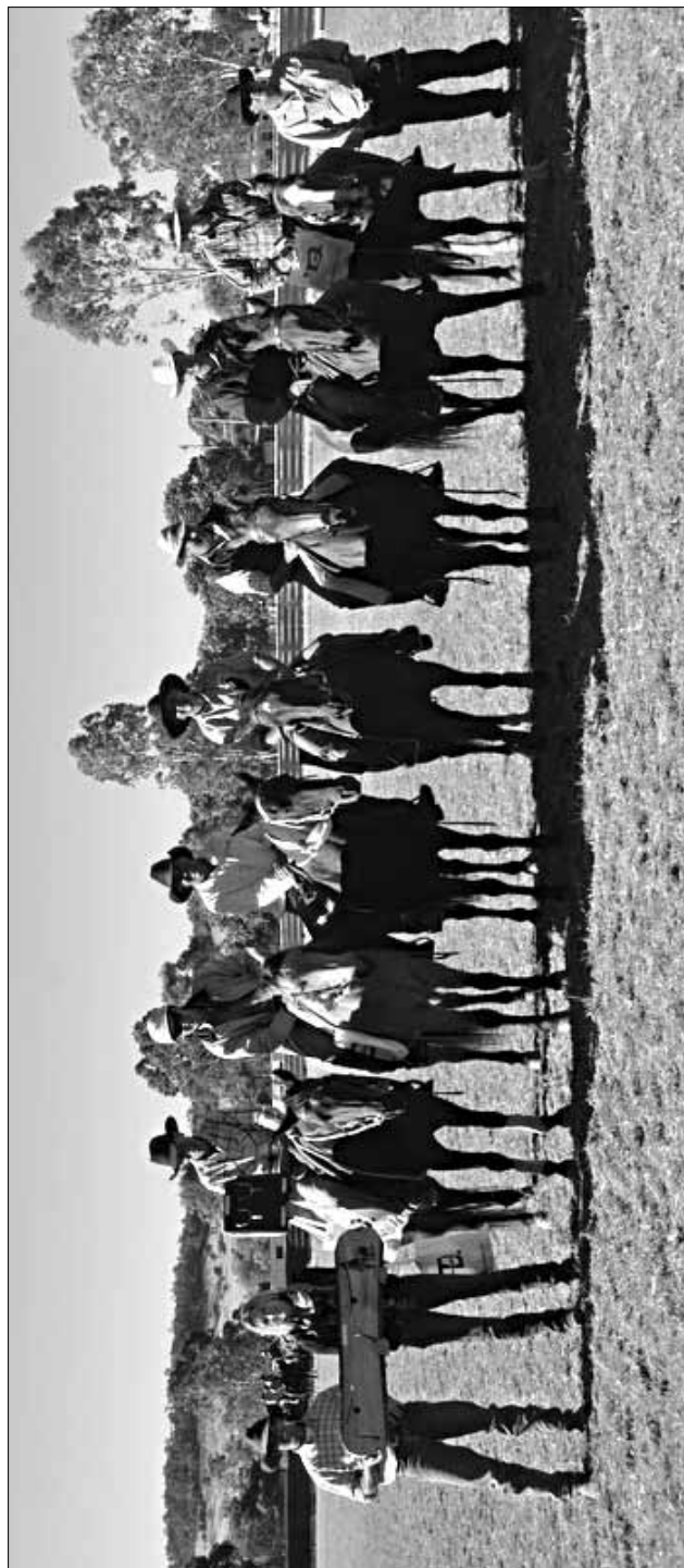
Winners of the 2015 Dunlop Santa Gertrudis Maiden Draft at Golden Spurs Campdraft.