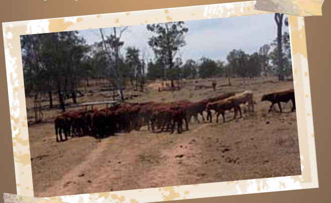
J. No 4 weaners after a lick delivery @ "Jingeri" in June 2014